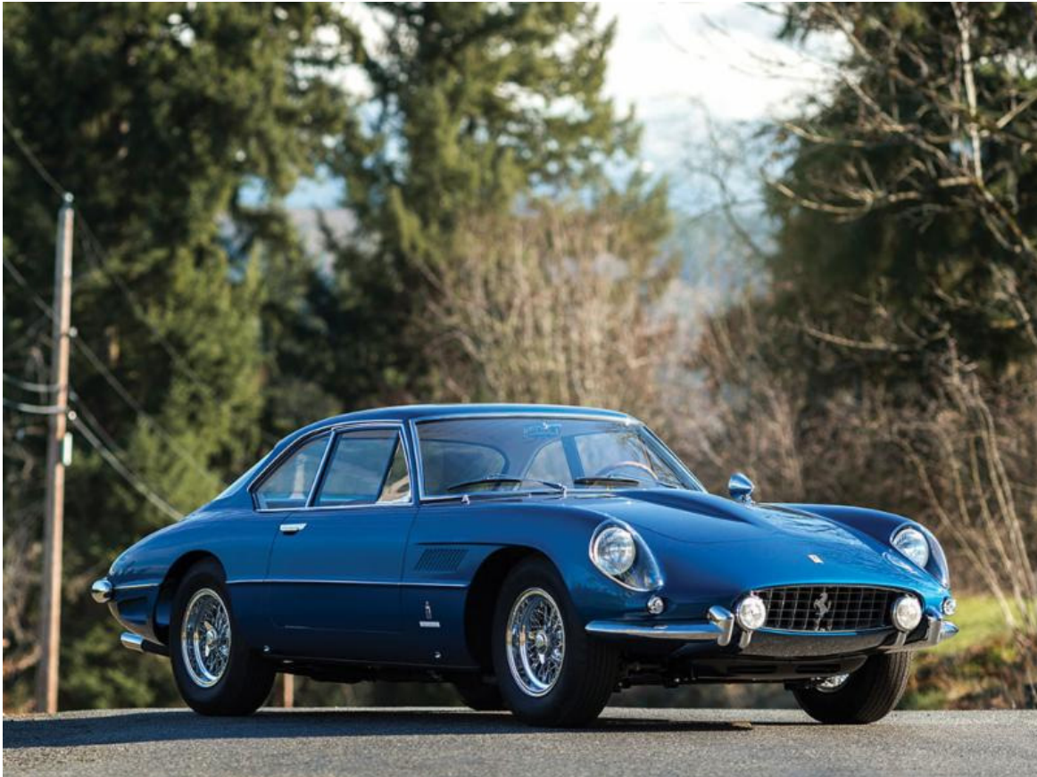
LOT 163 - 1962 Ferrari 400 Superamerica LWB Coupe Aerodinamico by Pininfarina Chassis no. 3949 SA $2,700,000 - $3,300,000

With less than a month until our Amelia Island auction, our digital catalogue is now ready to be viewed online and is packed with stunning photography and thoroughly researched descriptions.