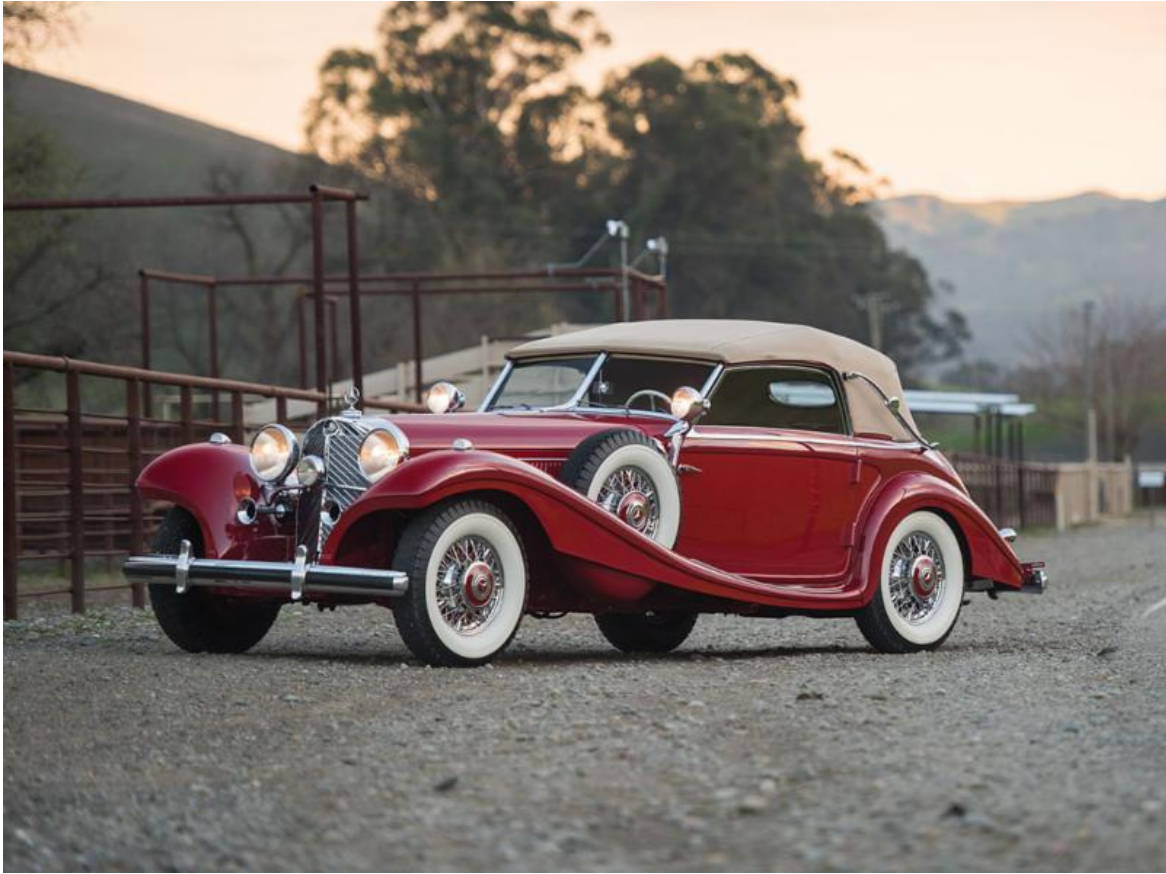
LOT 188 - 1939 Mercedes-Benz 540 K Spezial Cabriolet A by Sindelfingen Chassis no. 408371 $3,000,000 - $4,000,000