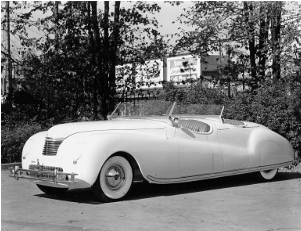
1941 Chrysler Newport

Concept Car Class shows the genesis of the styling and engineering philosophy that summoned Chrysler's industry-changing "Forward Look" in 1957.