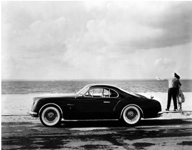
1953 Chrysler Delegation

Nine rare and important Chrysler Concept Cars from the forties, fifties and sixties will be presented together for the first time at the 19th annual Amelia Island Concours d'Elegance on March 9, 2014.