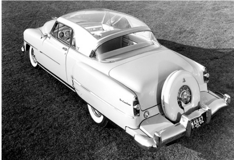
1954 Chrysler La Comtesse