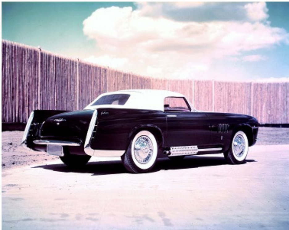
1955 Chrysler Falcon

The 1955 Chrysler Falcon from the Bortz Auto Collection of Highland Park, IL was Virgil Exner's favorite Concept Car. Packing a 375 horsepower Hemi V-8, the two-seat Falcon's aggressive styling still echoes in the style of the contemporary Chrysler 300C.