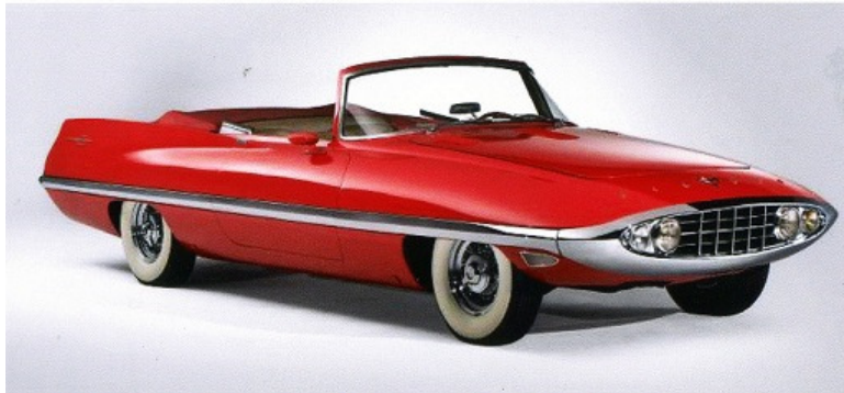
1956 Chrysler Diablo/Dart